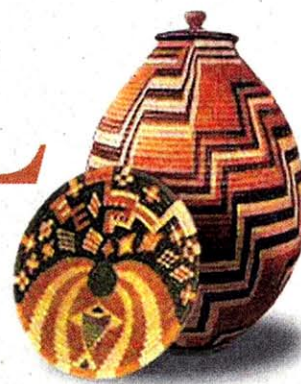
Handmade baskets are from Gantsi Craft, Botswana.

Santa Fe International Folk Art Market brings in artists and supports projects around the world